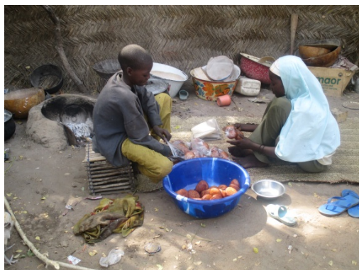
Family members prepare food