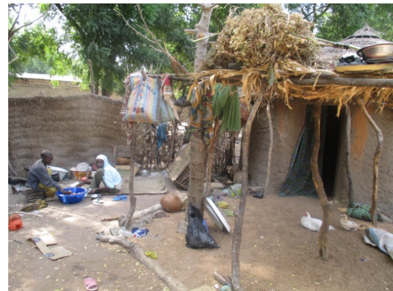
Huts in the family's compound